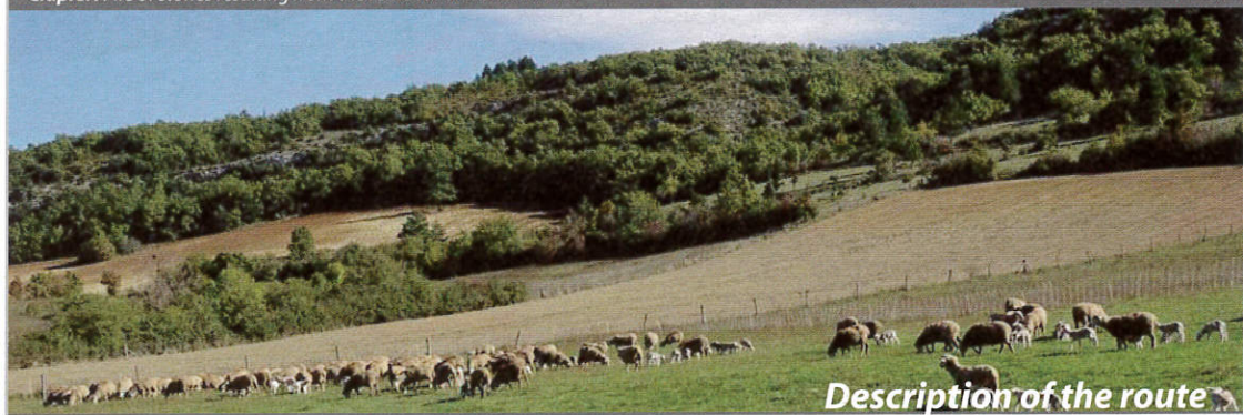
Description of the route

Clapier: Pile of stones resulting from the removal of stones in field